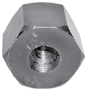
SHOCK MOUNT REMOVER , help prevent damage to the end threads, each EC583 63-82.....$19.95