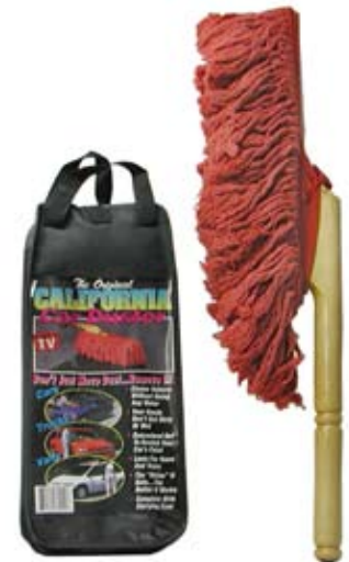
THE ORIGINAL CAR DUSTER , dust your car without scratching it, w/storage pouch, each EC581 .....$19.95