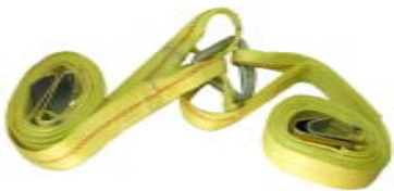
SLING , body lift, each E6457 63-82.....$84.99