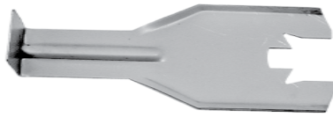
WINDSHIELD WIPER REMOVER , each E6240 63-67..... $7.00