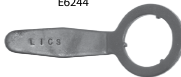
WRENCH , ignition screw nut, each E6244 63-65..... $8.50 E6245 66-67..... $8.50