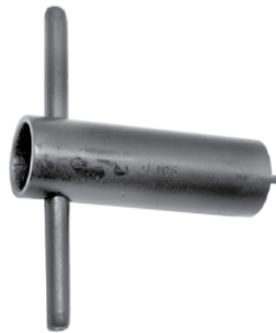
WRENCH , heater cable & windshield wiper nut, each E6243 63-67.....$10.00