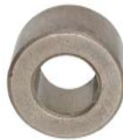
BUSHING , pilot, clutch, each E2794 53-90..... $3.95