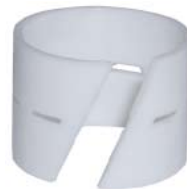
BUSHING , T-handle, replace the nylon bushing on your 4-speed, each E1869 64-67..... $6.95