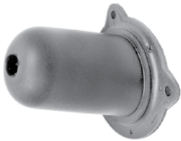
BOOT , clutch rod, each E6261 68-82.....$14.95