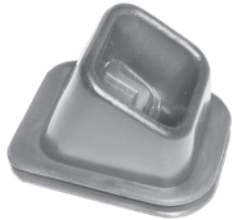
BOOT , clutch fork, rubber, black, each E2586 63-81..... $8.50