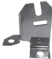
BRACKET , clutch cross shaft on frame, each E6324 80-81.....$13.50