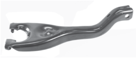
FORK , clutch, each E6221 55-60.....$47.95