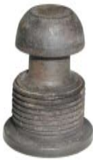
STUD , clutch fork ball, 1½" length, steel, each E2581 55-65,75-81 ..... $6.00